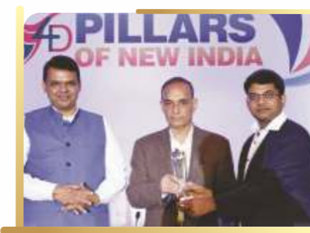
Awarded for FORTUNE HUNTERS OF NEW INDIA by Hon. State Minister, Shri. Satyapalji Singh in the presence of Shri. Devendraji Fadnavis