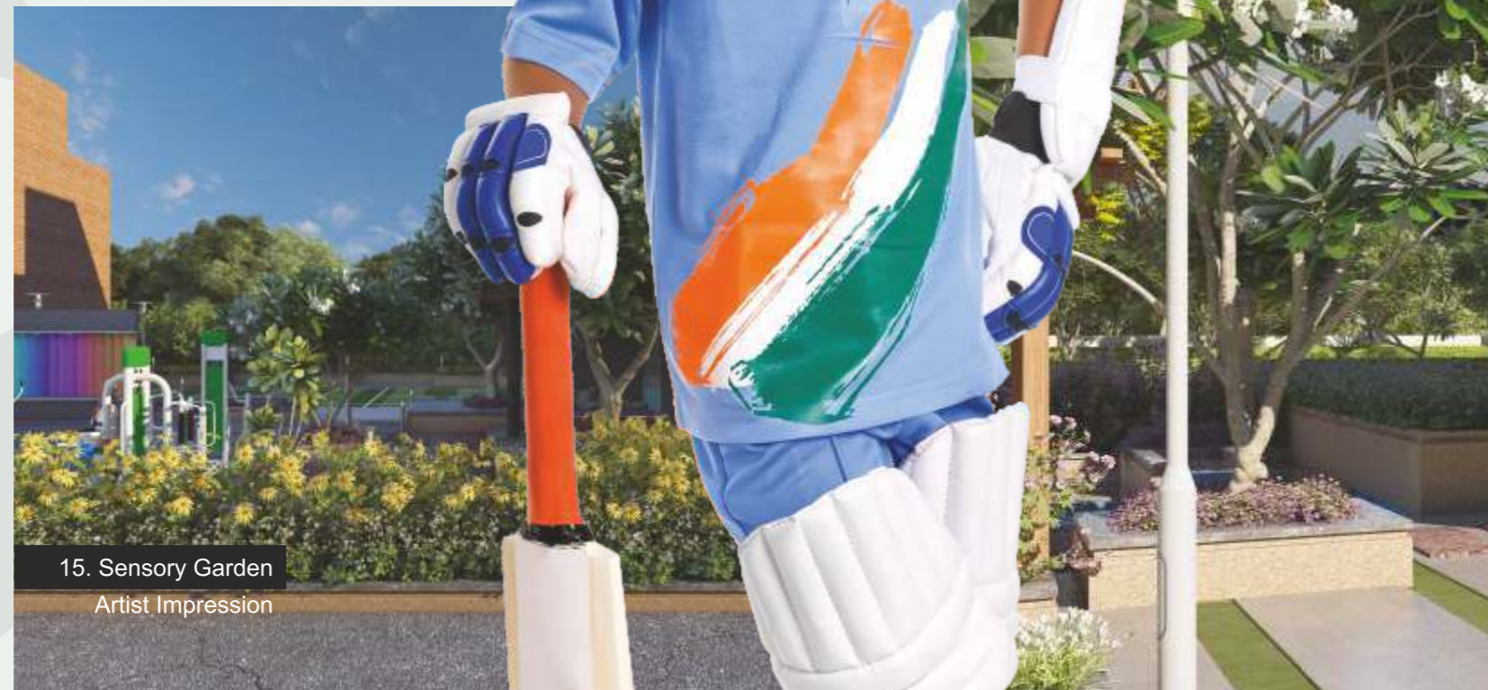
15. Sensory Garden Artist Impression