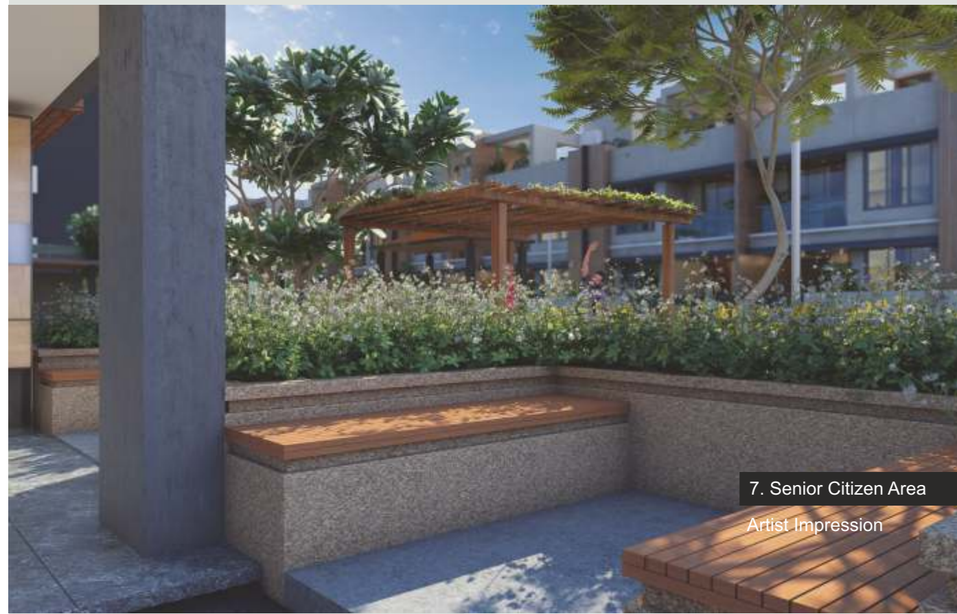
7. Senior Citizen Area Artist Impression