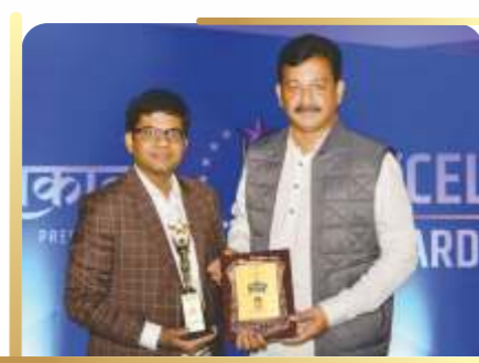
Awarded for BIGGEST BUILDER IN NASHIK by Hon. (Raje) Shri. Chhatrapati Sambhaji Maharaj