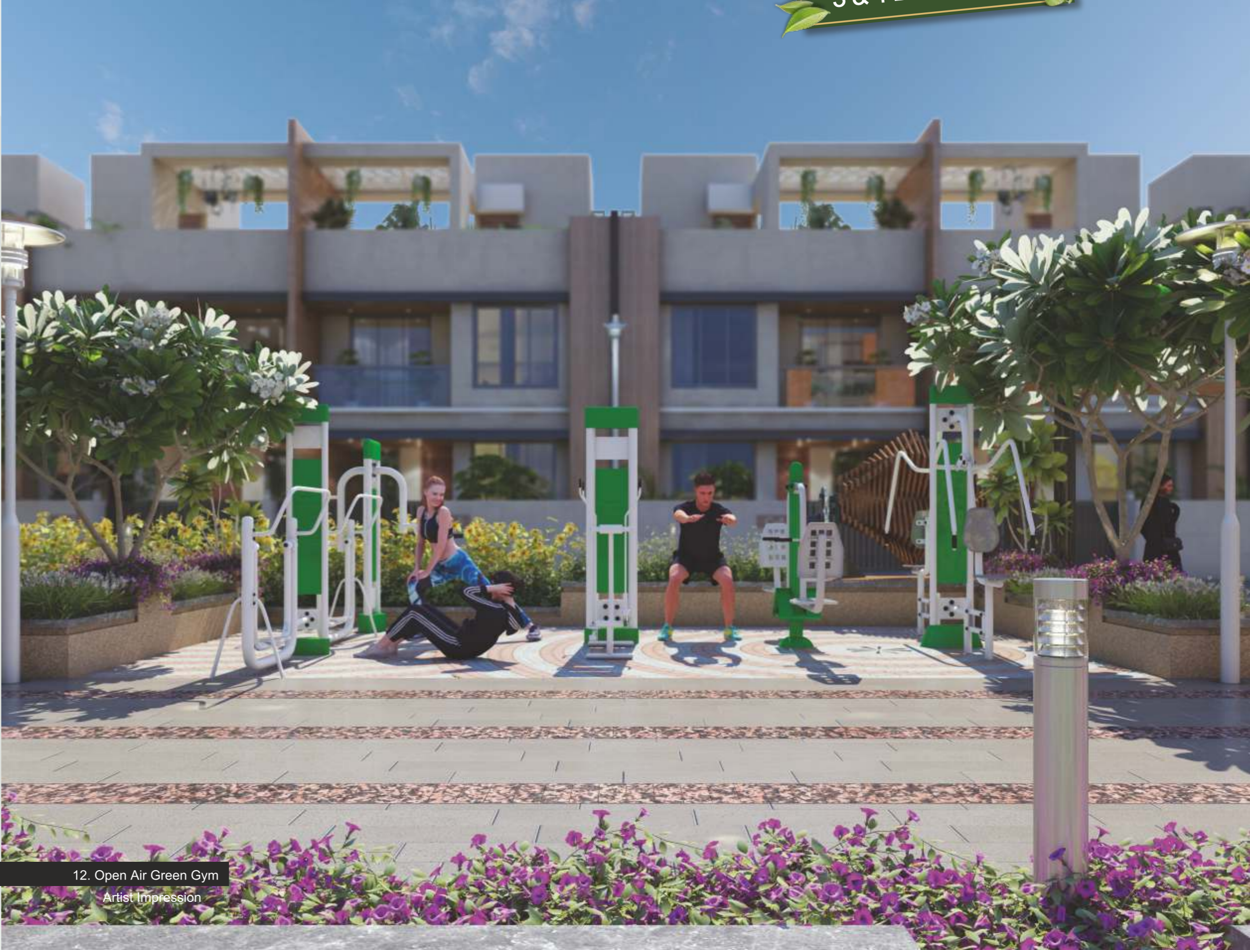
12. Open Air Green Gym Artist Impression