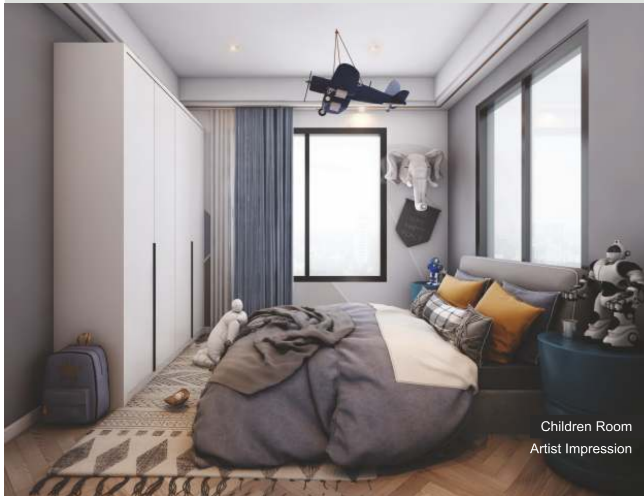
Children Room Artist Impression