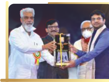
Awarded for GODA SANMAN By Hon. Shri Sanjayji Raut, M P & Executive Editor of SAMNA. Hon. Shri Chaganji Bhujbal, Cabinet Minister of Food & Civil Supply, Consumer Affairs in Govt. of Maharashtra & Hon. Shri Dadasaheb Bhuse, Minister of Agriculture, Govt. of Maharashtra