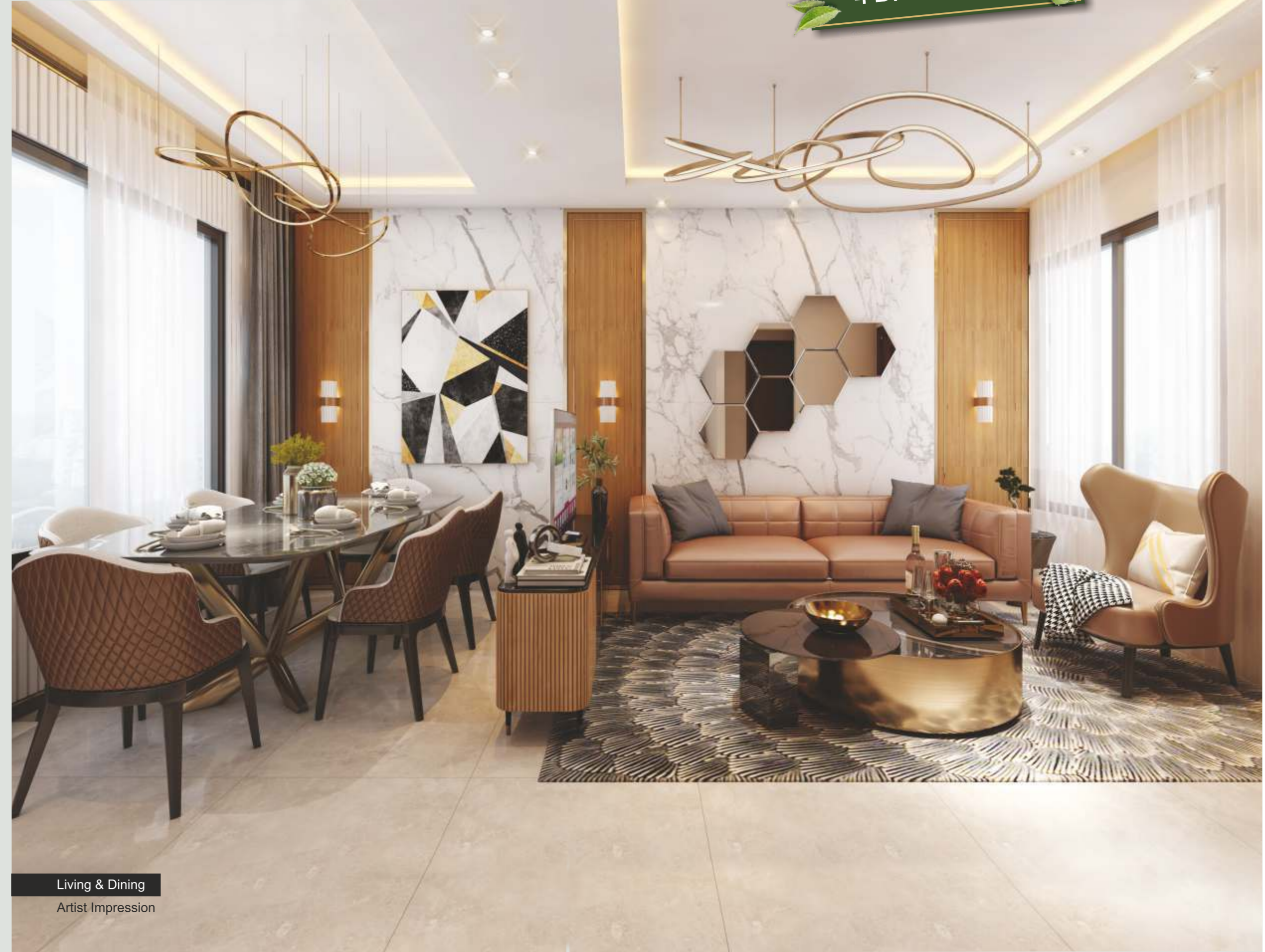
Living & Dining Artist Impression