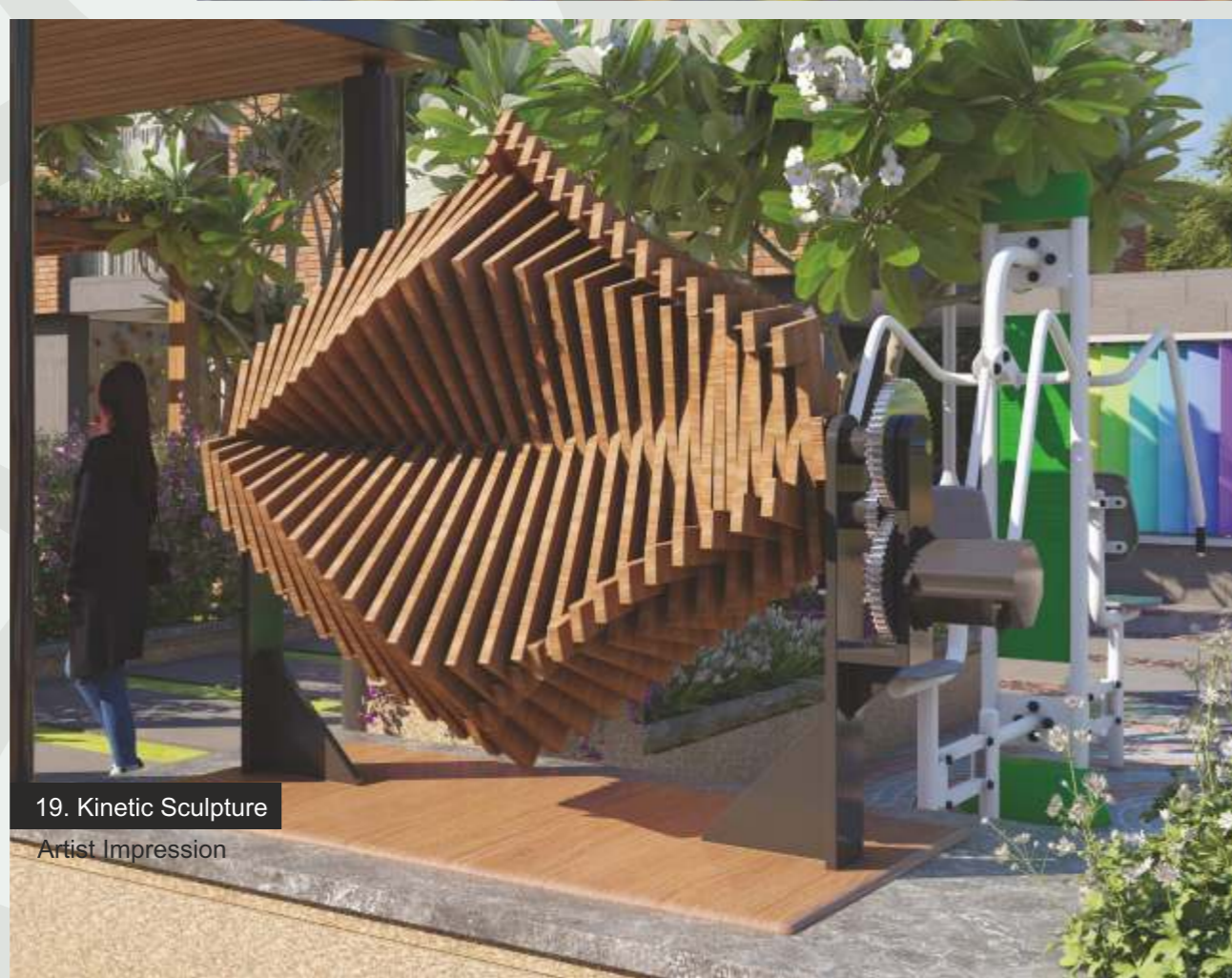
19. Kinetic Sculpture Artist Impression