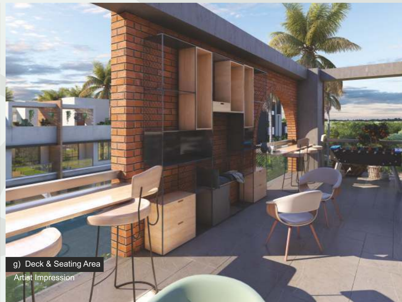
g) Deck & Seating Area Artist Impression