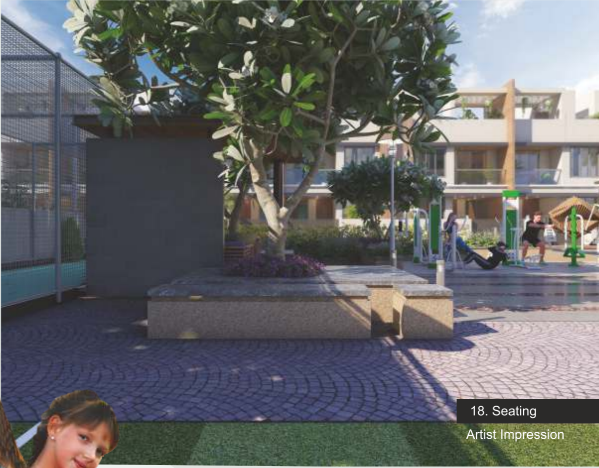
18. Seating Artist Impression