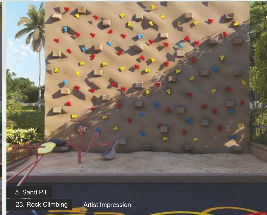
5. Sand Pit 23. Rock Climbing Artist Impression