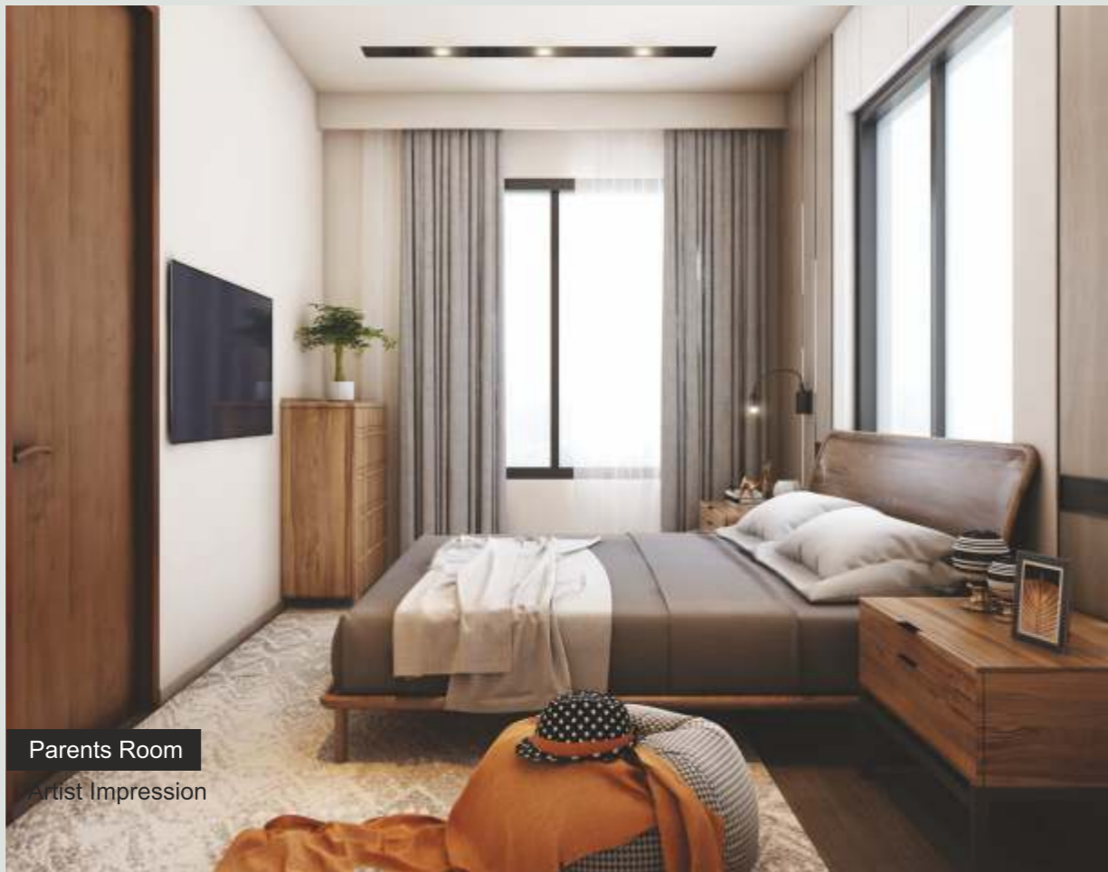
Parents Room Artist Impression