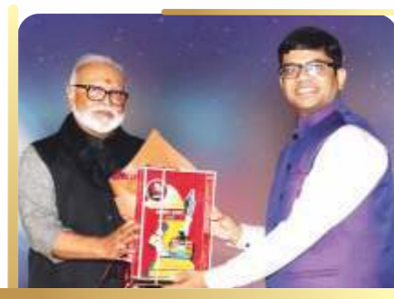
Awarded for REAL ESTATE HERO by Shri. Chaganji Bhujbal Cabinet Minister of Food & Civil Supply, Consumer Affairs in Government of Maharashtra.