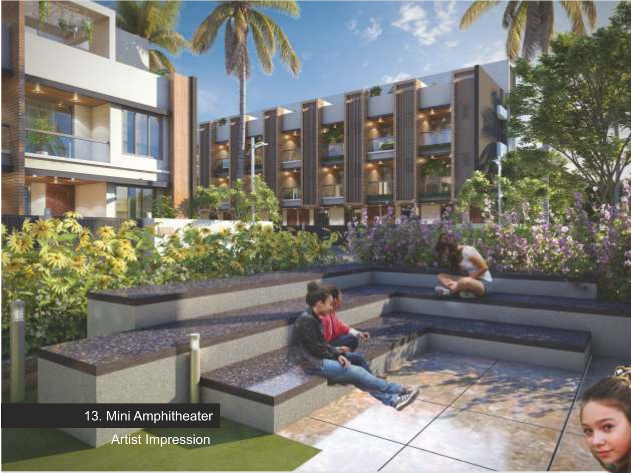
13. Mini Amphitheater Artist Impression