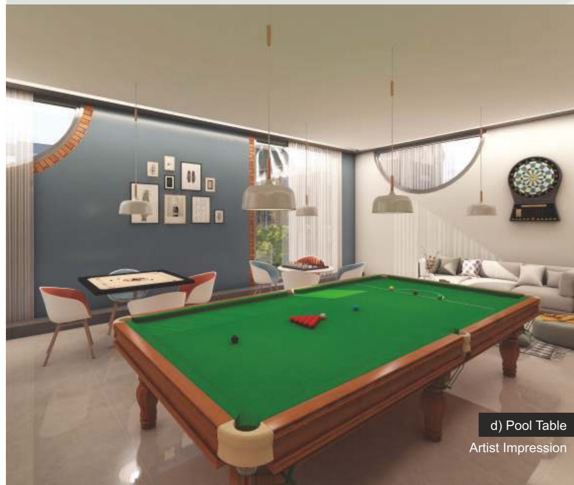
d) Pool Table Artist Impression