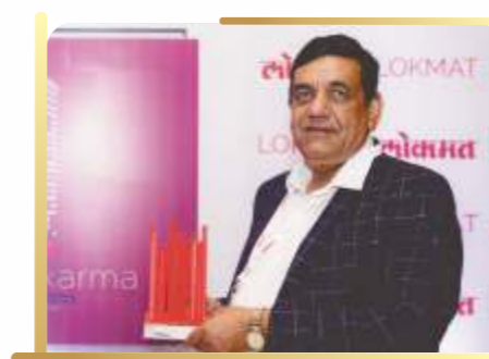
Awarded for THE DREAM BUILDERS by Shri. Devendraji Fadnavis