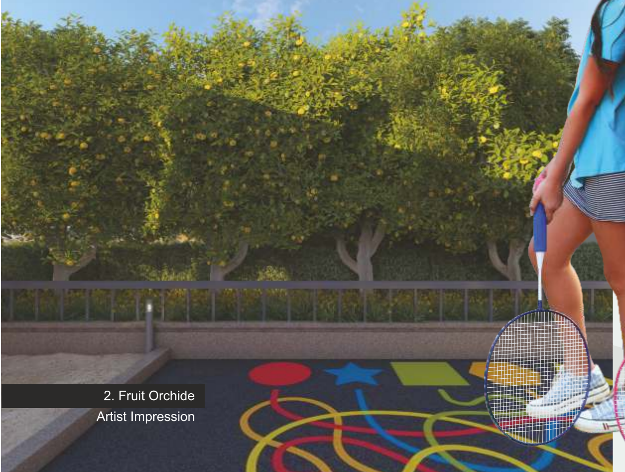
2. Fruit Orchide Artist Impression