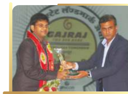
Awarded for NEXT BEST GENERATION BUILDER AWARD by Divya Marathi