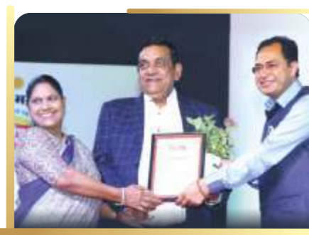
Awarded for PROUD MAHARASHTRIAN In Real Estate Category by Hon. Shri. Hanmantao Gaikwad