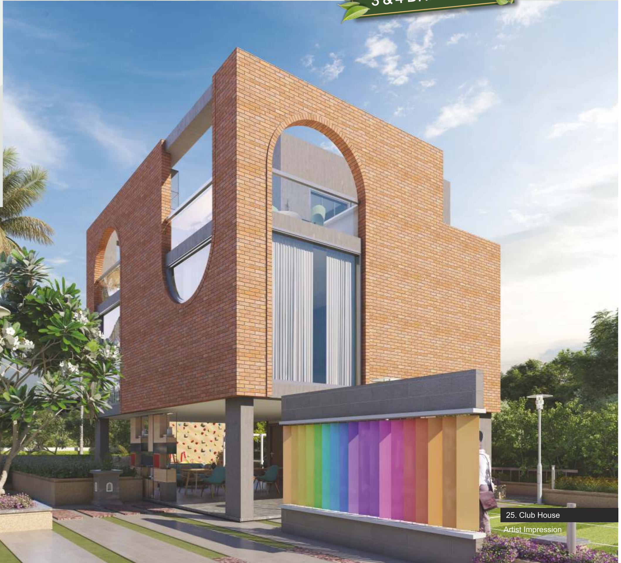
25. Club House Artist Impression