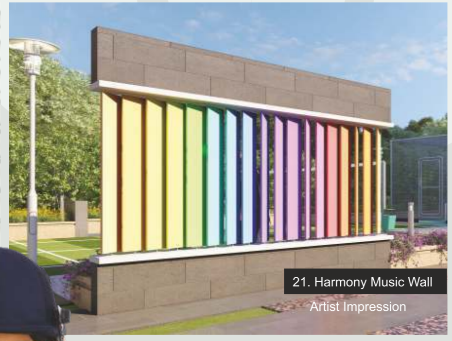
21. Harmony Music Wall Artist Impression