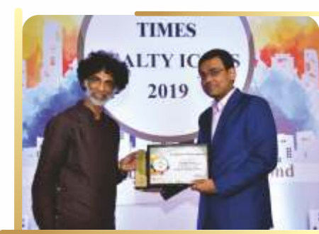
Awarded for ICONIC REALTOR OF THE YEAR NASHIK by Actor & Film Director Shri. Makarand Deshpande