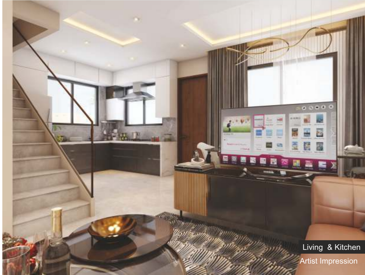
Living & Kitchen Artist Impression