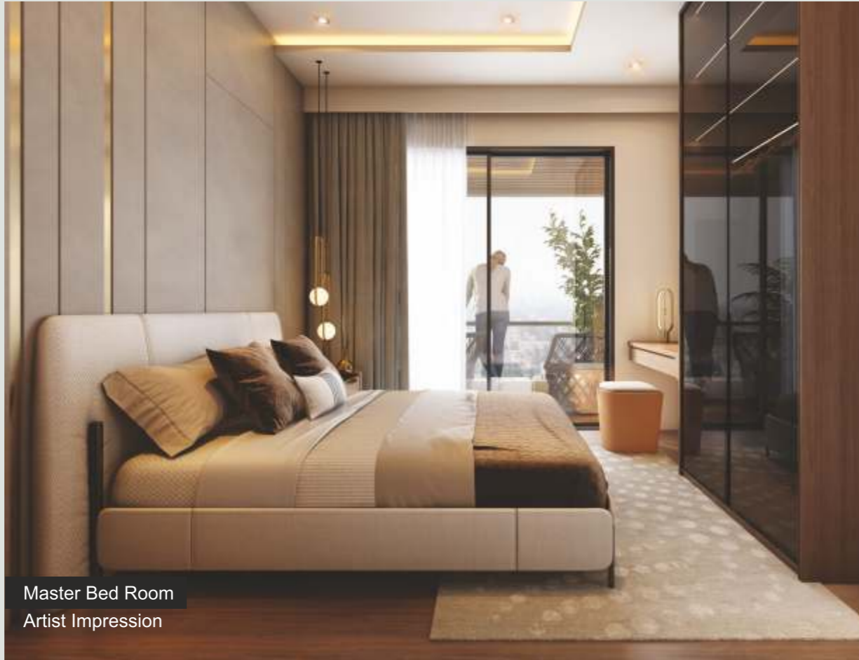
Master Bed Room Artist Impression