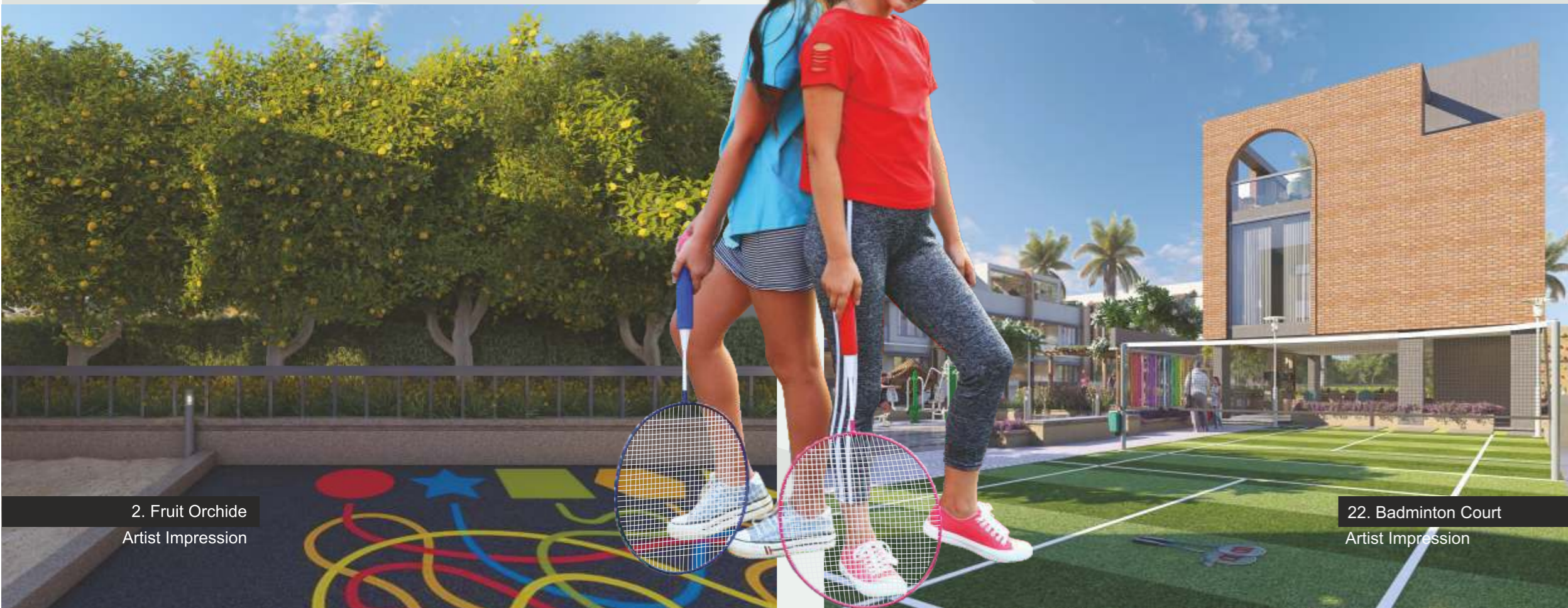
22. Badminton Court Artist Impression