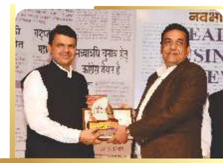
Awarded for AFFORDABLE HOMES WITH BEST AMENITIES by Shri. Devendraji Fadnavis