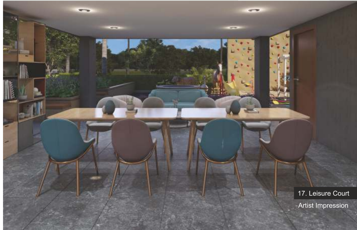
17. Leisure Court Artist Impression