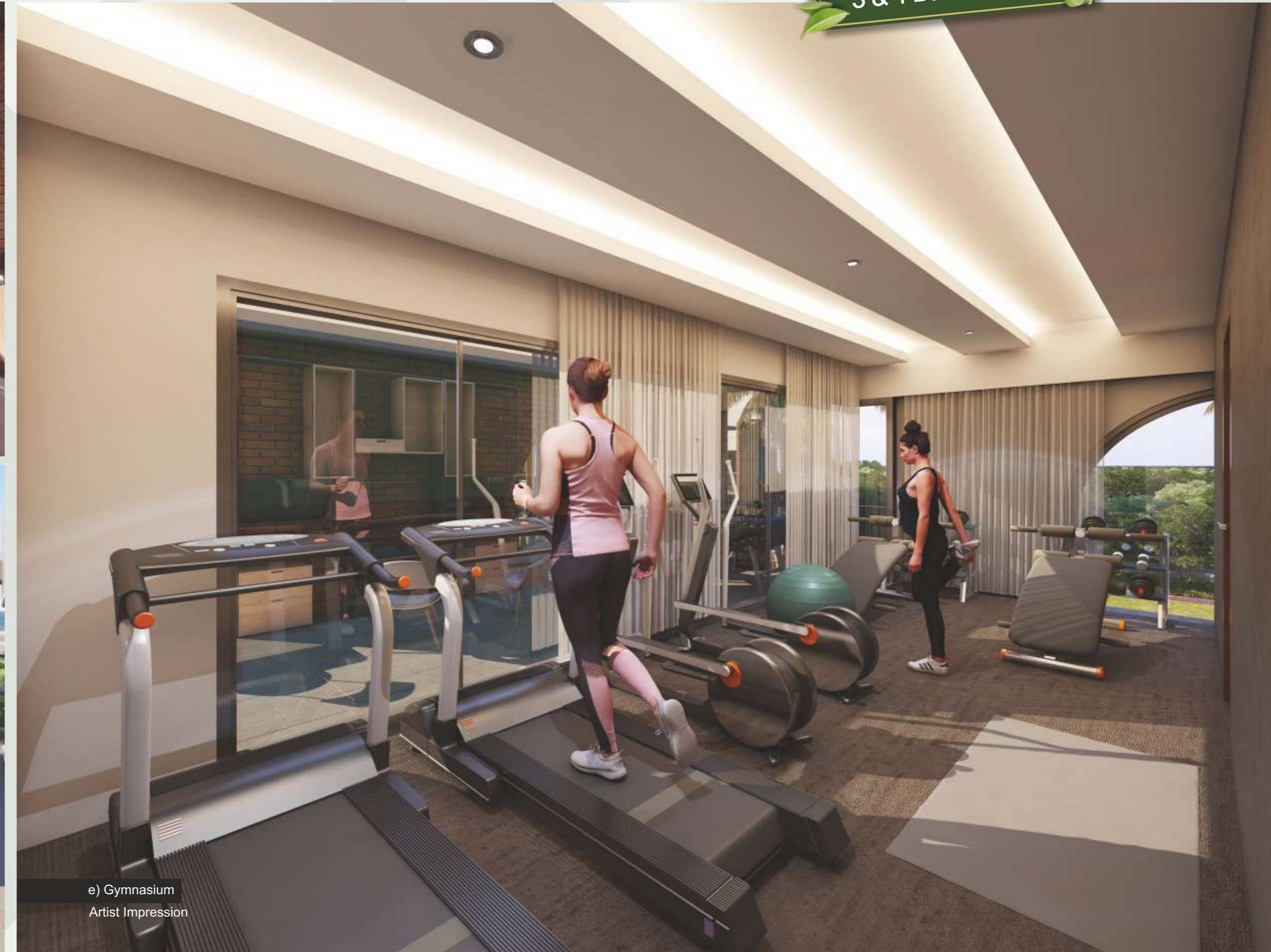
e) Gymnasium Artist Impression