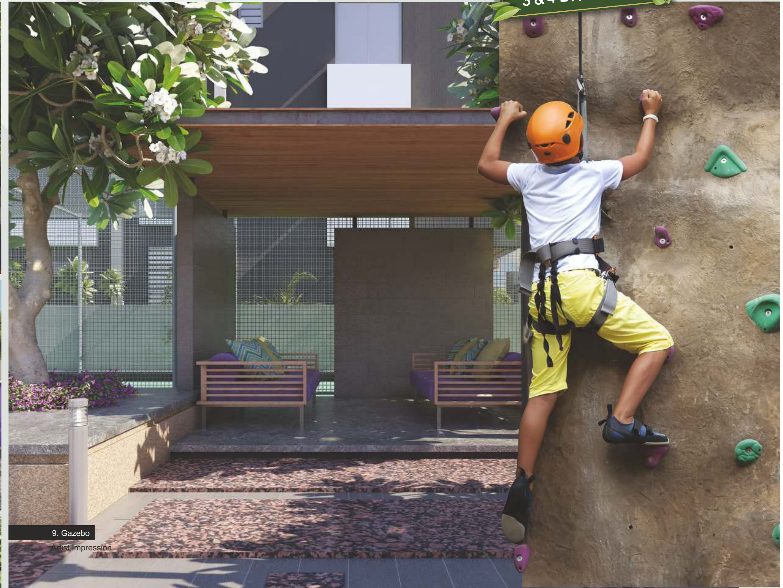
9. Gazebo Artist Impression