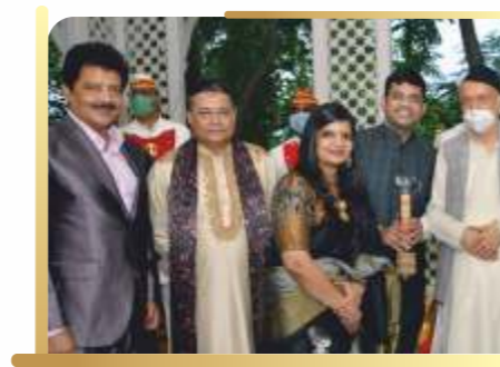
Awarded For MAHARASHTRA SANMAN by Shri Bhagat Singhji Koshyari Governor of Maharashtra