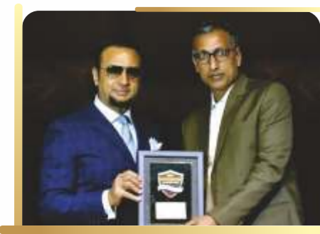
Awarded for EXCELLENCE IN BEST QUALITY & TIMELY DELIVERY CONSTRUCTION by Renowned Bollywood Actor Shri. Gulshan Grover