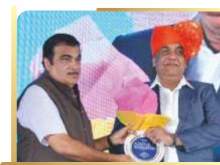
Awarded for ACHIEVERS OF MAHARASHTRA by Hon. Shri. Nitinji Gadkari Minister of Road Transport & Highway, Minister of Micro, Small & Medium Enterprises