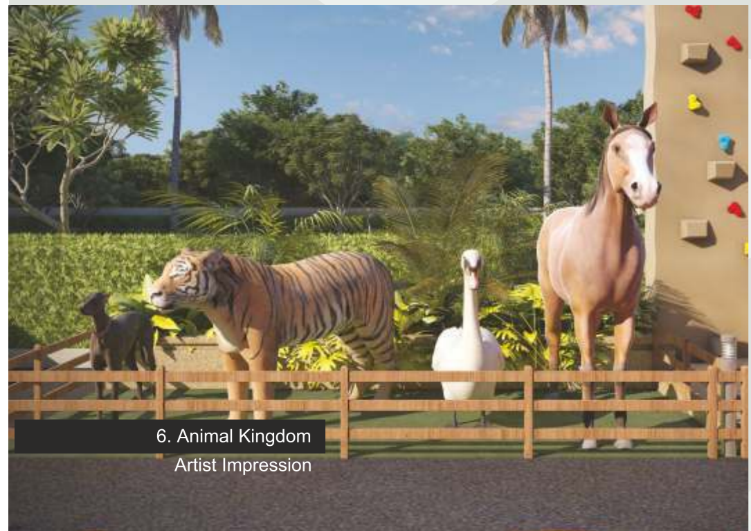
6. Animal Kingdom Artist Impression