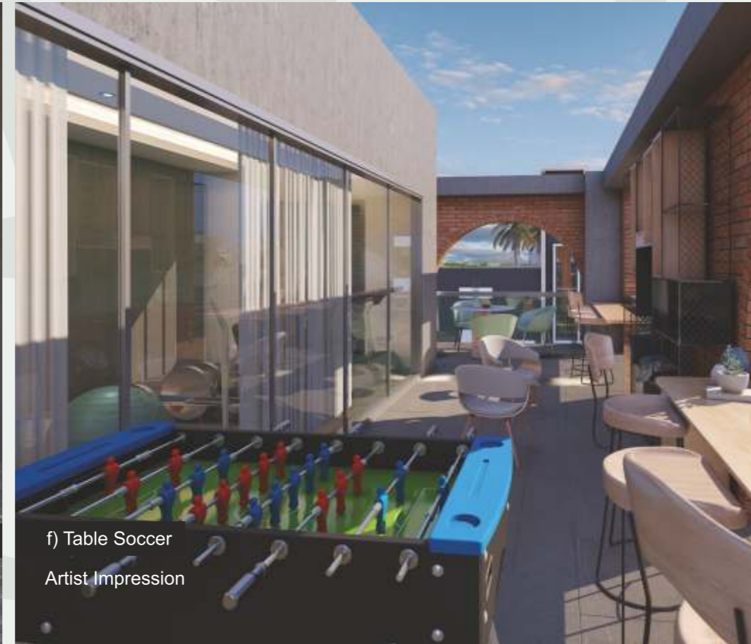
f) Table Soccer Artist Impression