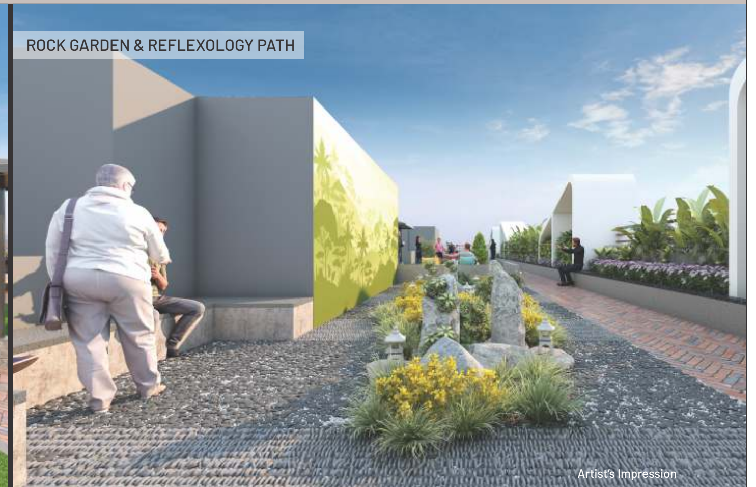
ROCK GARDEN & REFLEXOLOGY PATH