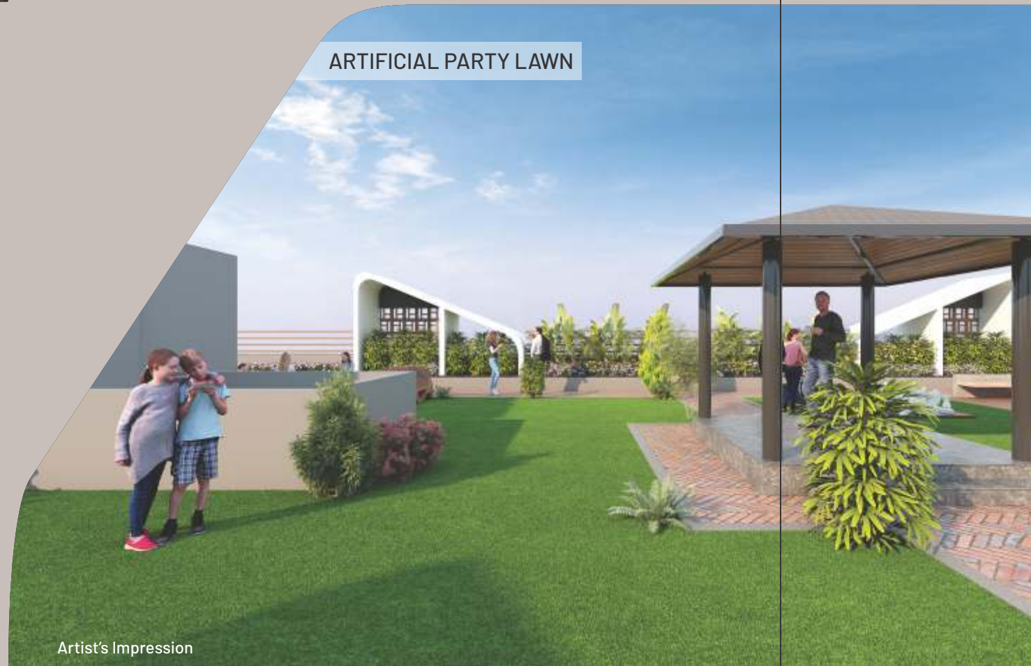
ARTIFICIAL PARTY LAWN