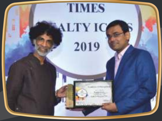
Awarded for "ICONIC REALTOR OF THE YEAR, NASHIK" by Actor & Film Director Shri. Makarand Deshpande Organised by Times Of India.