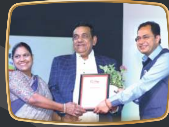
Awarded for "PROUD MAHARASHTRIAN AWARD" (In Real Estate Category) by Hon. Shri. Hanmantao Gaikwad