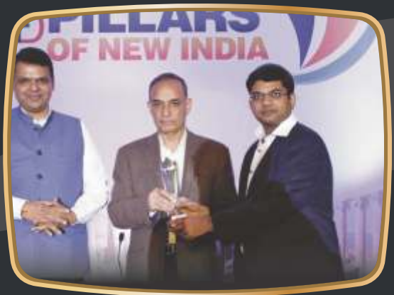
Awarded for "FORTUNE HUNTERS OF NEW INDIA" by Hon. State Minister Shri. Satyapalji Singh in the presence of Hon. C.M. Shri. Devendraji Fadnavis