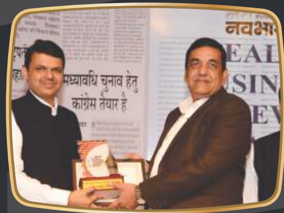
Awarded for "AFFORDABLE HOMES WITH BEST AMENITIES" By Hon. C. M. Shri. Devendraji Fadnavis