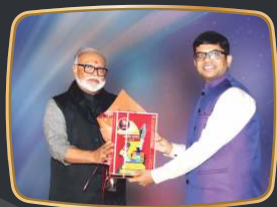
Awarded for "REAL ESTATE HERO" by Hon. Shri. Chaganraoji Bhujbal (Minister of Food and Civil Supply, Consumer Affairs Maharashtra.)