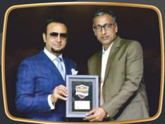
Awarded for "EXCELLENCE IN BEST QUALITY AND TIMELY DELIVERY CONSTRUCTION" by Renowned Bollywood Actor Shri. Gulshan Grover