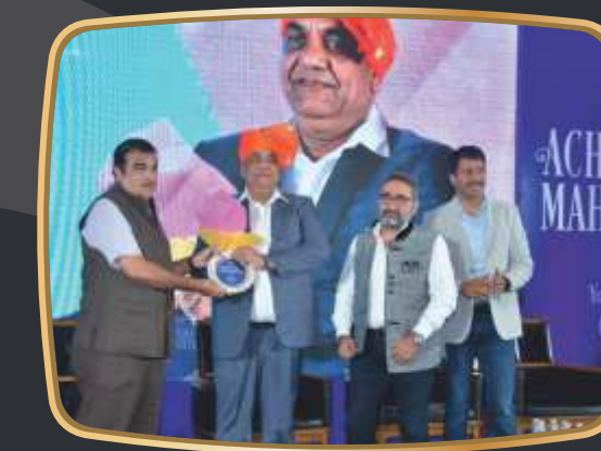
Awarded for "ACHIEVERS OF MAHARASHTRA" by Hon. Shri. Nitinji Gadkari (Minister of Road Transport & Highway, Minister of Micro, Small & Medium Enterprises)