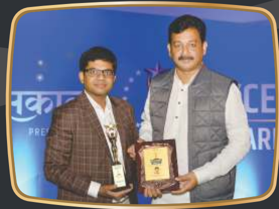
Awarded for "BIGGEST BUILDER IN NASHIK" by Hon. (Raje) Shri. Chhatrapati Sambhaji Maharaj