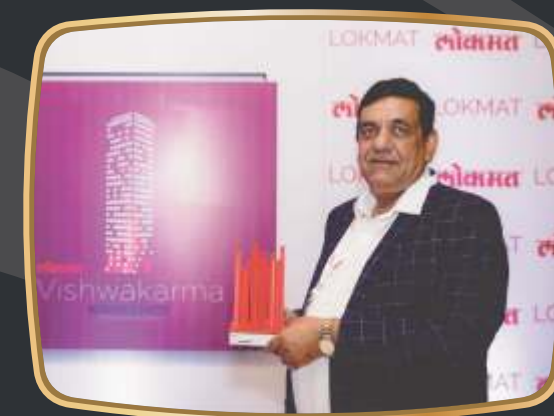
Awarded for "THE DREAM BUILDERS" by Hon. C.M. Shri. Devendraji Fadnavis on the occasion of Lokmat Vishwakarma - The Dream Builders Book Publication